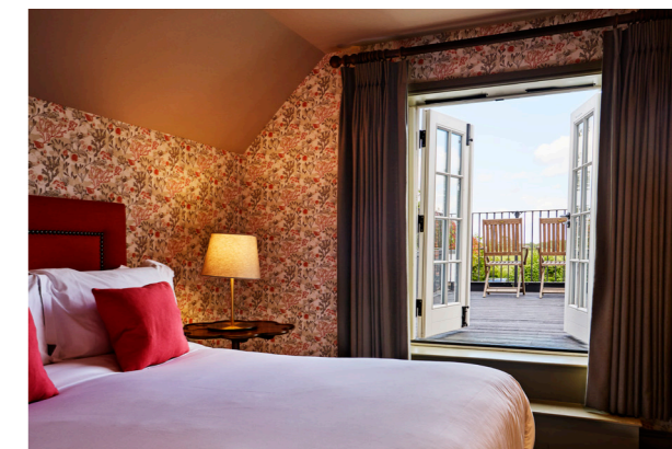
One of the Stunning The Black Horse Rooms

A: Yes, we do and we hope that everyone will join us in celebrating on Friday 7th March! Between 5pm and 6pm, we will be hosting a cocktail hour, where we will be handing out a "Taste of Clymping", followed by live music in the bar. Plus, for any Clymping residents booking with us for lunch or dinner that day, we will give you 25% off food too.