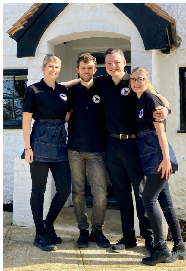
The Black Horse Team