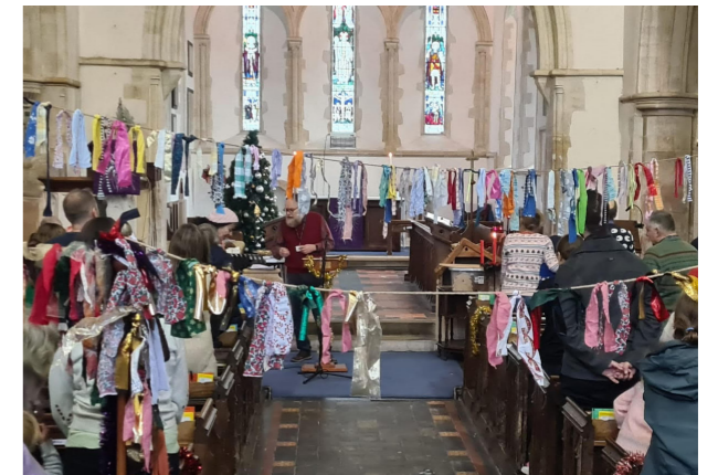
Decorations during Messy Church Family Service.

There will be a Good Friday service at Clymping at 2:00pm, and then our Easter Communion Celebration on Easter Day at 11:00am. Many of you will know that one of our Easter highlights used to be our sunrise communion on Clymping beach. Last year, we moved this to outside Ford Church due to the parking situation. We are still deciding what to do this year... again, keep an eye out on the website.