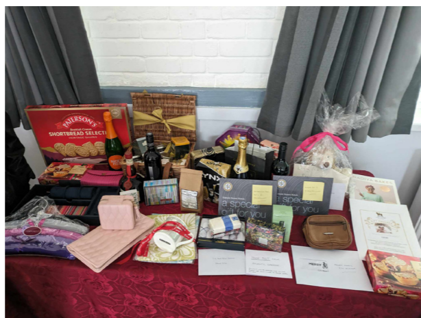
Raffle Prizes from Coffee Morning