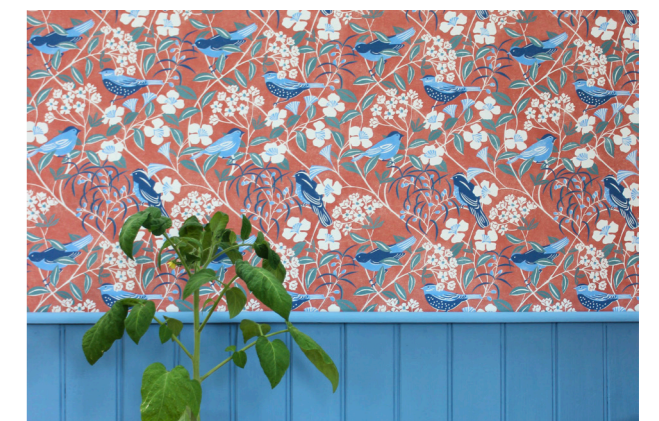
Tuscanny Lifestyle Design in Birdsong Collection

Watch my Instagram for updates (@Fiona.Howard.Wallpapers), or keep an eye on my website: www.fionahoward.com