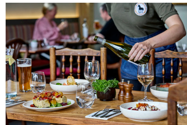
Dinning in at The Black Horse

Other feedback was to see more variety in our menu. Hence us focusing this year on ensuring we have interesting and seasonal specials on offer, supported by delicious pub classics. Our signature dish - the Clymping Fish Pie - has become one of the firm favourites for locals, and we intend to keep it on our menu, along with our popular home-made soups (particularly the Guinness & Cheddar soup). As well, our Black Horse ale is going down like a treat which is great.