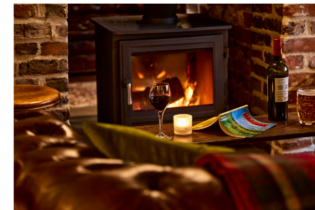
Cosy Nooks inside The Black Horse

A: The Quiz nights and Music nights will continue, and we will be showing the Six Nations Rugby and other key sporting events. Remember to put Wednesday 7th May in your diary when the Sompting Morris Dancers will be joining us! This year, we will be popping a postcard through the Clymping Street residents on the 1st of each month, and keeping you updated through this newsletter for other residents, so keep eyes open for news, exclusive offers and events.