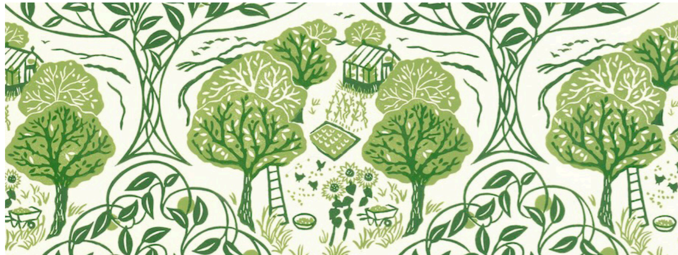
Apple Design in Orchard Collection