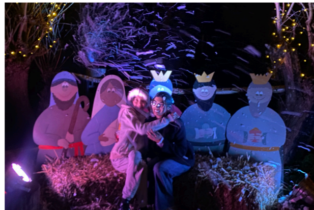
Snowy Photo Scene with Mary, Joseph and the 3 Wise Men!