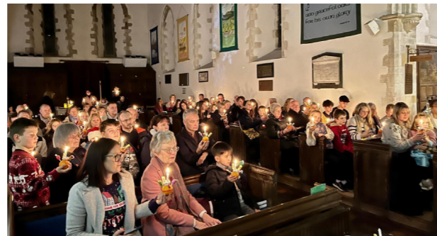
Christingle Christmas Eve Service.