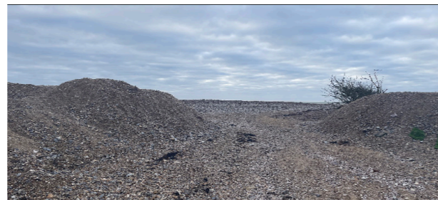
Gap through Bread Lane

Since April 2024, the natural wave activity, particularly over the winter period, has caused the crest through Bread Lane to roll back, increasing both the height and width of the crest. The Stop Order is still under review by West Sussex County Council Rights of Way team. We are awaiting a decision on this Order, which is due soon, before we can address the existing gap at Bread Lane.