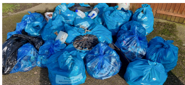
Successful Litter Pick Results.