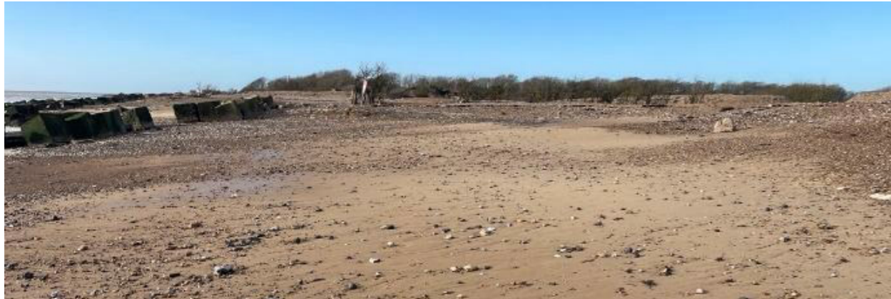
Climping Beach following Storm Bert in November 2024

CLIMPING BEACH HAS WEATHERED THE WINTER STORMS - HERE’S AN UPDATE ON THE LATEST DEVELOPMENTS AND FUTURE PLANS FOR BEACH MANAGEMENT