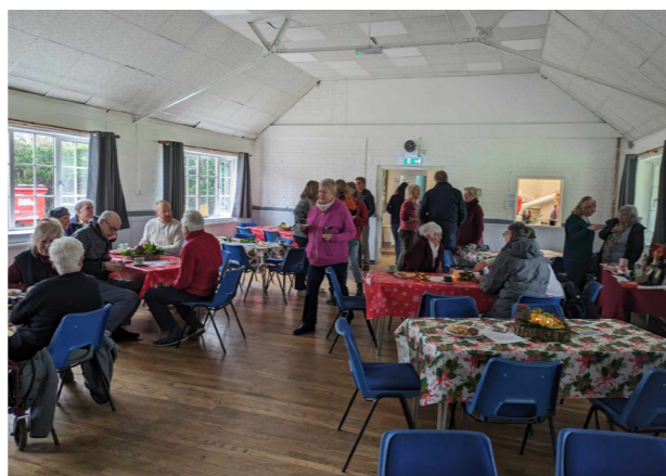
Socialising at Christmas Coffee Morning