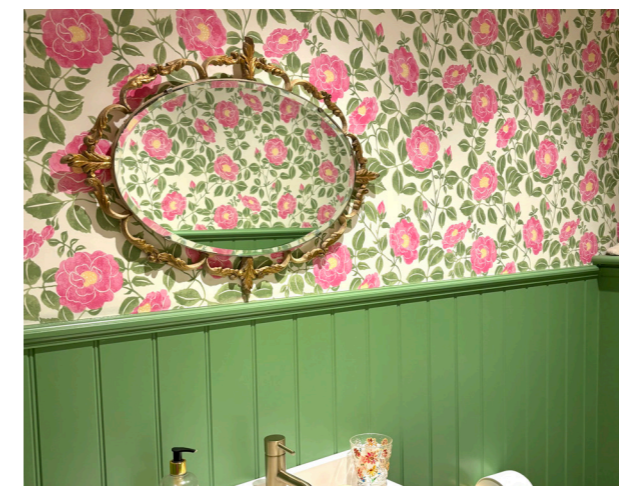
Rosy Arbor/Rosy Posy displayed in one of the The Black Horse Rooms

Q: Being a local resident, has your surroundings or community influenced some of your favourite pieces?